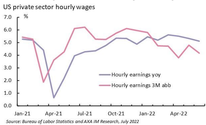
Exhibit 1 – Wages are not decelerating fast enough

We have entered this strange phase of the cycle when "good news are bad news", i.e., where signals of deterioration in the real economy can boost the valuation of risky assets because investors expect the central bank's tightening to be stopped in its tracks. As we discussed at length in the last two issues of Macrocast, the decline in the Purchasing Managers' Index (PMI) combined with the drop in US consumer spending in May triggered such reaction. Yet, the labour market remains the crux of the matter, since wage growth will decide whether inflation persists or not. Softening hiring intentions, according to the business surveys, combined with some normalisation in jobless claims, could make us expect the beginning of a deceleration in job creation which would ultimately significantly dampen wages. However, June payroll numbers came out stronger than expected (372k versus a market consensus at 265k). True, this is significantly slower than in Q1 on average (375k in Q2 against a whopping 540k in Q1), but still consistent with decent underlying economic activity, and thanks to another drop in the participation rate, the unemployment was unchanged over the month at 3.6%.